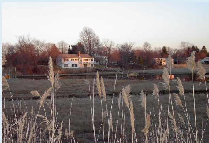
Coastal marshes in Old Saybrook and nearby properties are at risk from sea level rise.

Coastal cities and towns will become more vulnerable to storms in the coming century as sea level rises, shorelines erode, and storm surges become higher. Storms can destroy coastal homes, wash out highways and rail lines, and damage essential communication, energy, and wastewater management infrastructure.