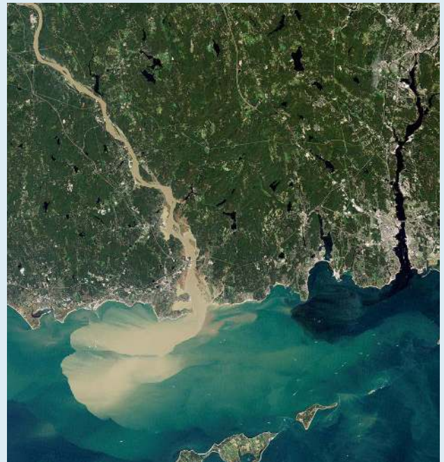
In 2011, Hurricane Irene filled the Connecticut River with muddy sediment as a result of erosion upstream. Heavy storms are becoming more common as a result of climate change.

Rising temperatures and shifting rainfall patterns are likely to increase the intensity of both floods and droughts. Average annual precipitation in the Northeast increased 10 percent from 1895 to 2011, and precipitation from extremely heavy storms has increased 70 percent since 1958. During the next century, average annual precipitation and the frequency of heavy downpours are likely to keep rising. Average precipitation is likely to increase during winter and spring, but not change significantly during summer and fall. Rising temperatures will melt snow earlier in spring and increase evaporation, and thereby dry the soil during summer and fall. So flooding is likely to be worse during winter and spring, and droughts worse during summer and fall.