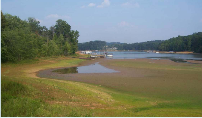
A drought in 2007 lowered water levels in Lake Lanier, which threatened metropolitan Atlanta's water supply and interfered with recreational activities. Droughts could become more severe as the climate warms.

next half century. But the amount of available water is likely to decrease, and soils are likely to become drier in most of the state, except along the coast.