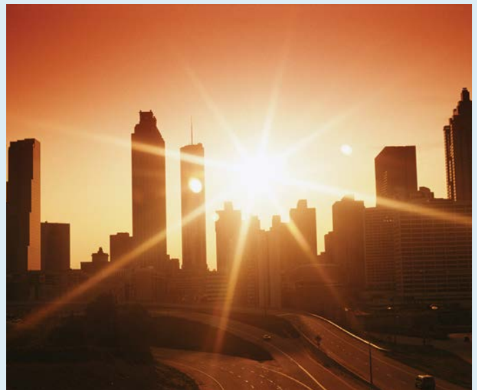
In large metropolitan areas like Atlanta, buildings and paved surfaces create an "urban heat island" that raises temperatures above surrounding areas and can worsen the health impacts of a heat wave.

Warmer air can also increase the formation of ground-level ozone, a key component of smog. Ozone has a variety of health effects, aggravates lung diseases such as asthma, and increases the risk of premature death from heart or lung disease. EPA and the Georgia Environmental Protection Division have been working to reduce ozone concentrations. As the climate changes, continued progress toward clean air will be more difficult.