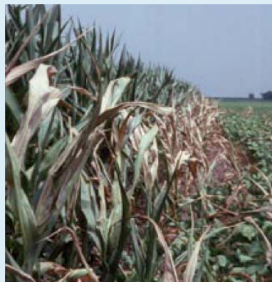
Parched and stunted corn during a summer drought in Illinois.

soybeans. Seventy years from now, southern Illinois is likely to have 15 to 20 more days with temperatures above 95°F than it has today. More severe droughts or floods would also hurt crop yields.