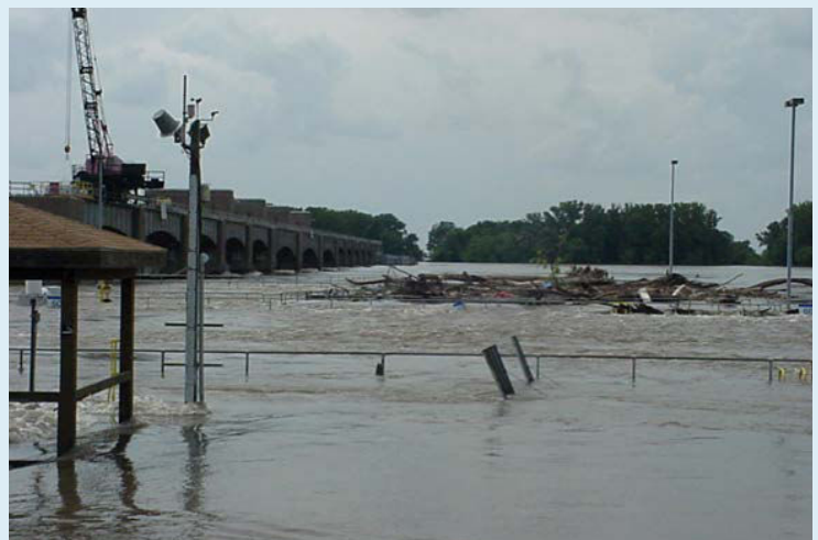
The Mississippi River flooding at the Quincy Lock and Dam 21 in Quincy in June 2008. The lock is submerged in the foreground and the dam is visible to the left.

Flooding occasionally threatens both navigation and riverfront communities, and greater river flows could increase these threats. In 2011, a combination of heavy rainfall and melting snow caused a flood that closed the Ohio and Mississippi rivers to navigation and prompted evacuation of Cairo due to concerns that its flood protection levees might fail. To protect Cairo, the U.S. Army Corps of Engineers opened the Birds Point-New Madrid Floodway, which lowered the Mississippi River by flooding more than 100,000 acres of farmland in Missouri. The flood caused $360 million of damage to infrastructure, property, and agricultural yields upstream.