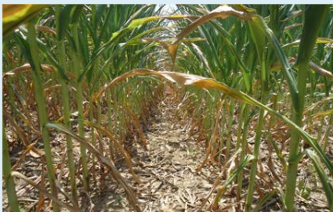
Increasingly hot summers and droughts could reduce yields of corn.

Changing the climate will have both beneficial and harmful effects on farming. Longer frost-free growing seasons and higher concentrations of atmospheric carbon dioxide would increase yields for some crops during an average year. But increasingly hot summers are likely to reduce yields of corn and possibly soybeans. Seventy years from now, much of Indiana is likely to have 5 to 15 more days per year with temperatures above 95°F than it has today. More severe droughts or floods would also hurt crop yields.