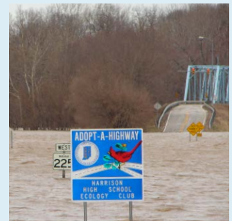
Heavy rain flooded the Wabash River in March 2009, including this section north of Lafayette.

Flooding occasionally threatens both navigation and riverfront communities, and greater river flows could increase these threats. In 2011, a combination of heavy rainfall and melting snow caused flooding along the Ohio and Wabash rivers in Southern Indiana and closed the lower Ohio River to navigation.