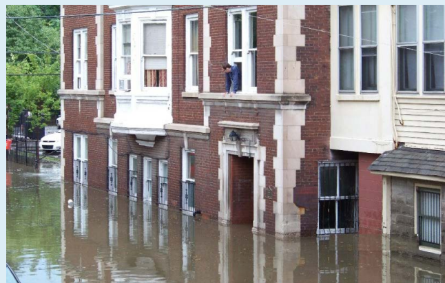
Flooding at Third and Magnolia Streets in Louisville after heavy rains in August 2009.

Flooding is becoming more severe in the Southeast. Since 1958, the amount of precipitation during heavy rainstorms has increased by 27 percent in the Southeast, and the trend toward increasingly heavy rainstorms is likely to continue. The Tennessee Valley Authority (TVA) and the U.S. Army Corps of Engineers operate Kentucky Dam, Wolf Creek Dam, and other dams to prevent serious floods on the Ohio, Tennessee, and Cumberland rivers. The agencies release water from the reservoirs behind these dams before the winter flood season. By lowering water levels, these releases provide greater capacity for the reservoirs behind those dams to prevent flooding. Nevertheless, dams and other flood control structures cannot prevent all floods. The Ohio River has flooded Louisville several times, for example, and flash floods have caused property destruction and deaths throughout Kentucky.