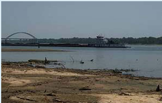
A barge passes by Paducah during a period of low water on the Ohio River in summer 2005. Drought conditions caused shipping delays throughout the region.

Increasingly severe droughts could pose challenges for river transportation. The drought of 2005 closed portions of the lower Ohio River to commercial navigation, which delayed shipments of crops and other products between Kentucky and the Mississippi River. In 2012, a drought caused navigation restrictions on the lower Mississippi River, which cost the region more than $275 million.