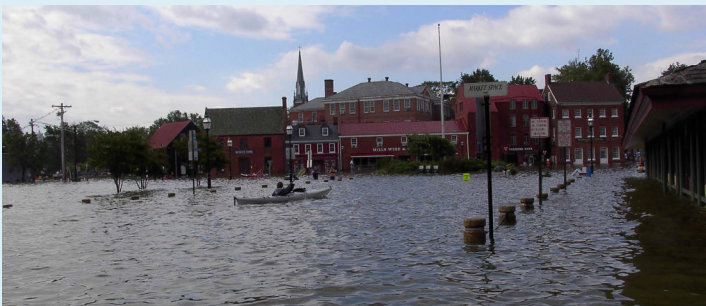
Downtown Annapolis the day after Hurricane Isabel struck the Atlantic coast on September 18, 2003.

Although hurricanes are rare, their wind speeds and rainfall rates are likely to increase as the climate continues to warm. Rising sea level is likely to increase flood insurance rates, while more frequent storms could increase the deductible for wind damage in homeowner insurance policies.