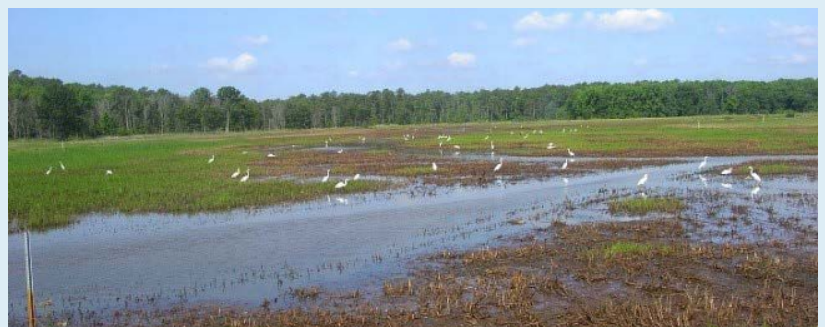
Sea level rise threatens coastal wetlands like this marsh at Blackwater Wildlife Refuge, along with the ecosystems and fisheries they support.

Beaches also erode as sea level rises. A higher ocean level makes it more likely that storm waters will wash over a barrier island or open new inlets. The United States Geological Survey estimates that Assateague Island is likely to be broken up by new inlets or lost to erosion if sea level rises two feet by the year 2100. Eroding beaches along Chesapeake Bay and its tributaries are likely to be squeezed between the advancing water and stone revetments erected to protect development along the shore. Even towns with "Beach" in their names are seeing their beaches replaced with hard shore protection structures.