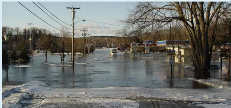
The Sandy River flooded Farmington in January 2006.

Rising temperatures and shifting rainfall patterns are likely to increase the intensity of both floods and droughts. Average annual precipitation in the Northeast increased 10 percent from 1895 to 2011, and precipitation from extremely heavy storms has increased 70 percent since 1958. During the next century, average annual precipitation and the frequency of heavy downpours are likely to keep rising. Average precipitation is likely to increase during winter and spring, but not change significantly during summer and fall. Rising temperatures will melt snow earlier in spring and increase evaporation, and thereby dry the soil during summer and fall. So flooding is likely to be worse during winter and spring, and droughts worse during summer and fall.