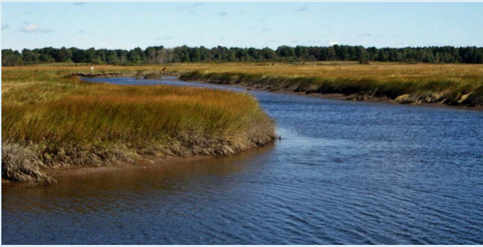
Sea level rise threatens salt marshes like Scarborough Marsh, which is Maine's largest.