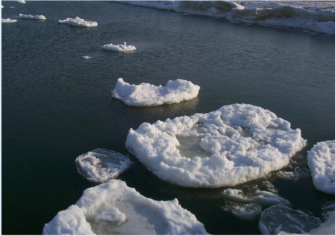
Ice forming on Lake Michigan near St. Joseph.