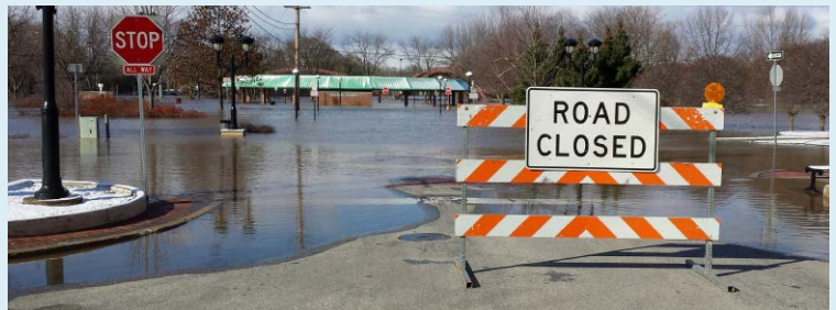
Heavy rains and snowmelt flooded the Tittabawassee River in Midland in April 2015.

Changing the climate is likely to increase the frequency of floods in Michigan. Over the last half century, average annual precipitation in most of the Midwest has increased by 5 to 10 percent. But rainfall during the four wettest days of the year has increased about 35 percent. During the next century, spring rainfall and annual precipitation are likely to increase, and severe rainstorms are likely to intensify. Each of these factors will tend to further increase the risk of flooding.