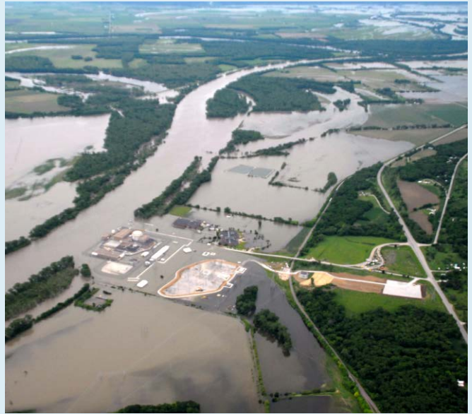
The Fort Calhoun Nuclear Power Plant in eastern Nebraska was surrounded by a Missouri River flood in June 2011.

Scientists do not know how the frequency and severity of tornadoes will change. Rising concentrations of greenhouse gases tend to increase humidity, and thus atmospheric instability, which would encourage tornadoes. But wind shear is likely to decrease, which would discourage tornadoes.