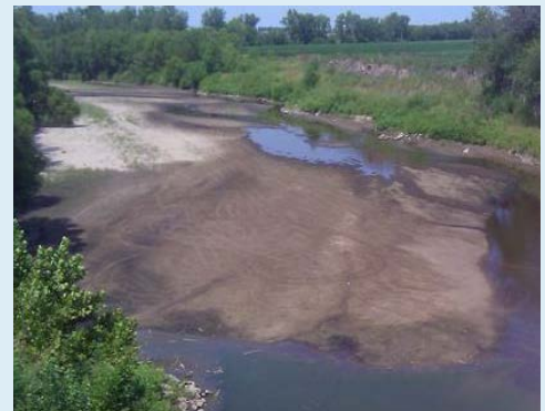
The severe drought of 2012 led to low flow in rivers across Nebraska. This photo shows the nearly dry riverbed of the Big Nemaha River near Falls City.

Higher temperatures and drier soils are likely to increase the use of water by more than 25 percent during the next 50 years, mostly because of increased irrigation. Approximately one-third of the farmland in Nebraska is irrigated with ground water, most of which comes from the High Plains Aquifer System, and municipal