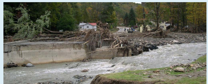
Torrential downpours flooded Alstead and neighboring communities in 2005, causing millions of dollars of damage.

Rising temperatures and shifting rainfall patterns are likely to increase the intensity of both floods and droughts. Average annual precipitation in the Northeast increased 10 percent from 1895 to 2011, and precipitation from extremely heavy storms has increased 70 percent since 1958. During the next century, average annual precipitation and the frequency of heavy downpours are likely to keep rising. Average precipitation is likely to increase during winter and spring, but not change significantly during summer and fall. Rising temperatures will melt snow earlier in spring and increase evaporation, and thereby dry the soil during summer and fall. So flooding is likely to be worse during winter and spring, and droughts worse during summer and fall.