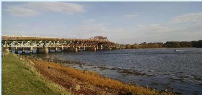
The Great Bay area has marshes and infrastructure that are at risk from sea level rise.

Coastal cities and towns will become more vulnerable to storms in the coming century as sea level rises, shorelines erode, and storm surges become higher. Storms can destroy coastal homes, wash out highways and rail lines, and damage essential communication, energy, and wastewater management infrastructure.