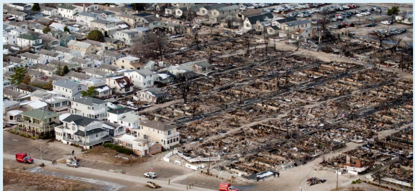
Breezy Point, Queens, in the aftermath of an electrical fire ignited by floodwaters during Hurricane Sandy.

Rising sea level increases the vulnerability of coastal homes and infrastructure to flooding because storm surges become higher as well. Although hurricanes are rare, much of the infrastructure in the New York metropolitan area is vulnerable to flooding. In 2012, high waters during Hurricane Sandy flooded Amtrak, PATH, and subway tunnels, as well as electrical substations, wastewater treatment plants, telecommunication facilities, hospitals, and nursing homes. Wind speeds and rainfall rates during hurricanes and tropical storms are likely to increase as the climate warms. Rising sea level is likely to increase flood insurance premiums, while more frequent storms could increase the deductible for wind damage in homeowner insurance policies.