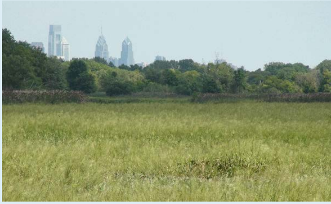
Tidal marshes like this one at Tinicum are vulnerable to destruction and saltwater intrusion as sea level rises.

The tidal freshwater wetlands along the Delaware River are likely to capture enough sediment for their land surfaces to keep pace with rising sea level. But both rising sea level and increasing drought enable salt water to mix farther up the Delaware River, which could kill wetland plants. In places where that occurs, wetlands might be replaced by either salt-tolerant wetland plants or shallow waters. Higher salinity could also create problems for Philadelphia's water supply during droughts, if salty water moves upstream to the city's drinking water intake at Torresdale.