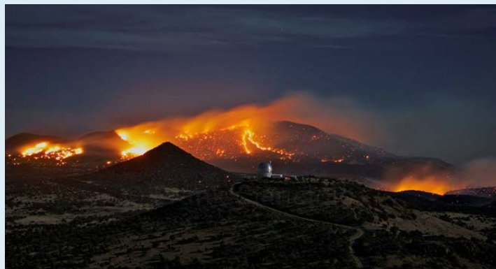
The 2011 drought contributed to widespread wildfires in Texas, like this one behind the McDonald Observatory near Fort Davis.

The combination of more fires and drier conditions may expand deserts and otherwise change parts of the Texas landscape. Many plants and animals living in arid lands are already near the limits of what they can tolerate. A warmer and drier climate would generally extend the Chihuahuan desert to higher elevations and expand its geographic range. In some cases, native vegetation may persist and delay or prevent expansion of the desert. In other cases, fires or livestock grazing may accelerate the conversion of grassland to desert in response to the changing climate. For similar reasons, some forests may change to desert or grassland.