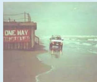
An eroded beach on North Padre Island impairs public access along the shore.

Whether or not storms become more intense, coastal homes and infrastructure will flood more often as sea level rises, because storm surges will become higher as well. The rising sea is likely to increase flood insurance rates, while more frequent storms could increase the deductible for wind damage in homeowner insurance policies. Many cities, roads, railways, ports, airports, and oil and gas facilities along the Gulf Coast are vulnerable to the combined impacts of storms and sea level rise. People may move from vulnerable coastal communities and stress the infrastructure of the communities that receive them.